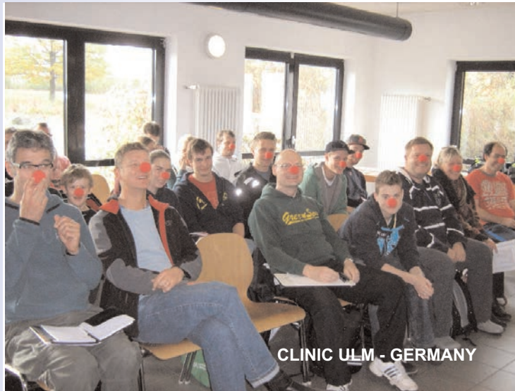
CLINIC ULM - GERMANY

This experience and with the assistance of the Dutch Federation we were able to learn and discover many tips and tricks for recruiting new youth members, including marketing and merchandising. Our committee is grateful for the cooperation and help from several volunteers from the Netherlands..