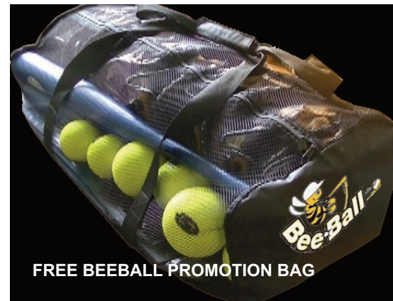
FREE BEEBALL PROMOTION BAG

Unfortunately the clinic in Sweden had to be postponed due to logistical reasons, and the clinic for Ukraine had to be postponed due to the political situation.