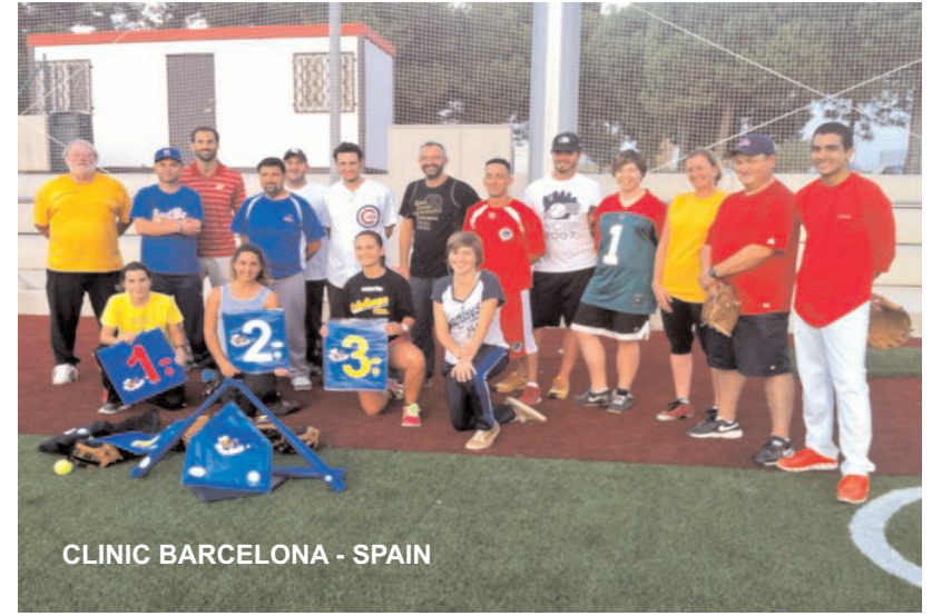
CLINIC BARCELONA - SPAIN