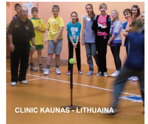
CLINIC KAUNAS - LITHUAINA

For personal reasons further applications for some clinics would not be honored. However, various activities were started in digital form for the promotion of BeeBall.