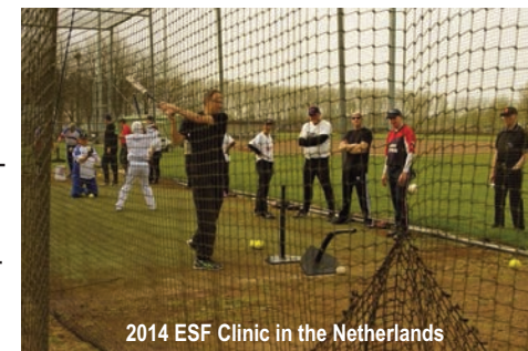
2014 ESF Clinic in the Netherlands